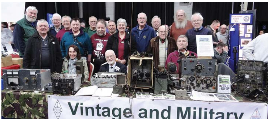
Members of VMARS and visitors gather at their NARSA rally stand.