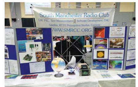
South Manchester Club also had an impressive stand at the NARSA rally in Blackpool.