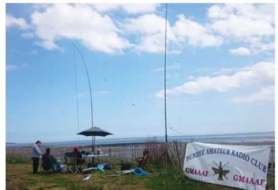
The Dundee club were actively taking part in the RNLI SOS week at the start and end of May. Thanks to all we talked to.